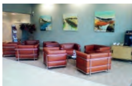
Gail at Biocity, Nottingham