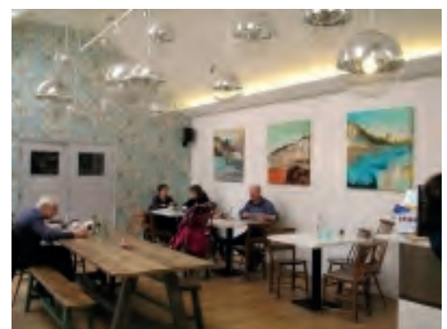
Showing at Balzano's